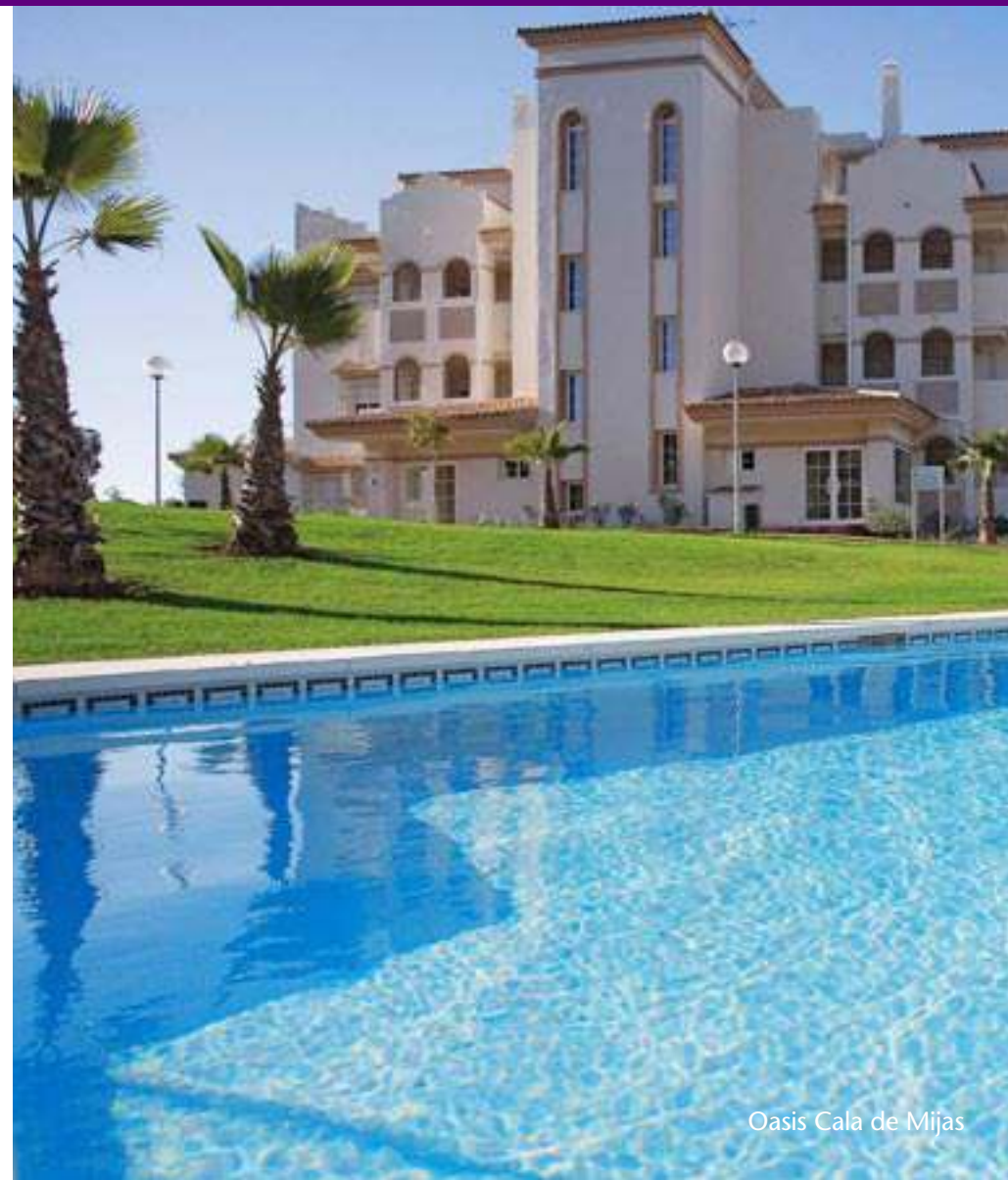
Oasis Cala de Mijas