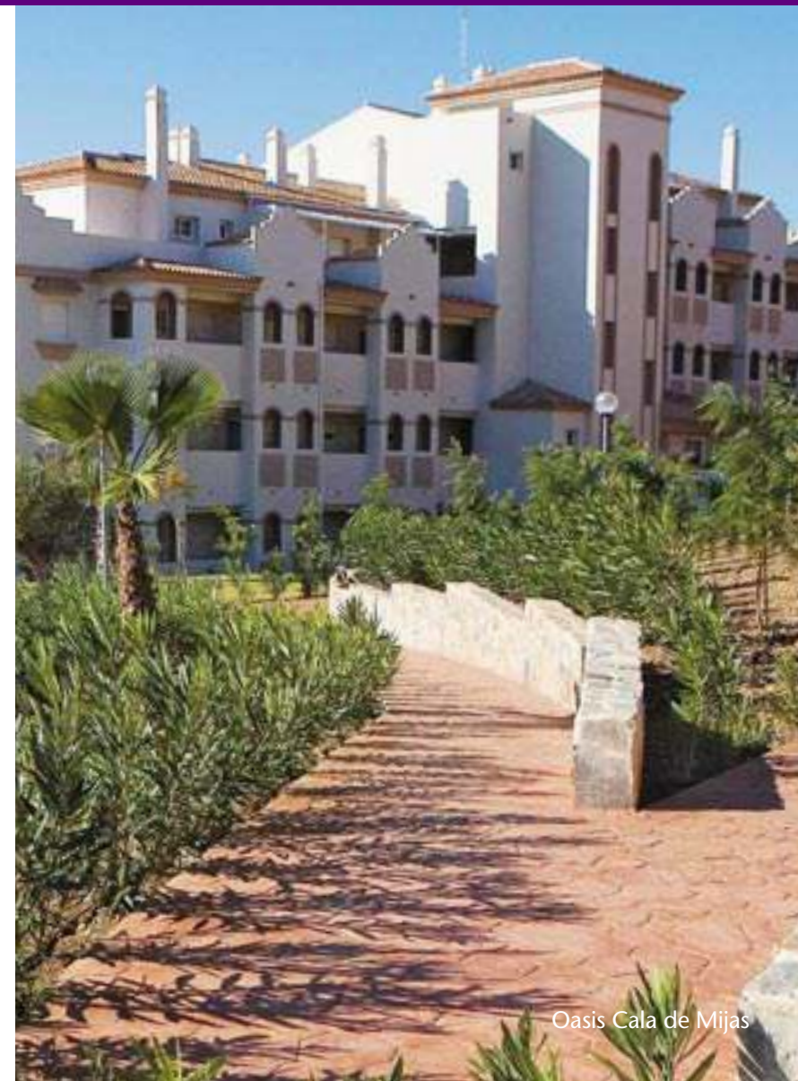
Oasis Cala de Mijas

You can own a property at Oasis Cala de Mijas from as little as 221.739€